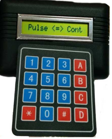
Fig. 3. Control module. Example of user interface.

However, user interface was implemented. It is not fully intuitive, but it's really easy to be accustomed to use it.